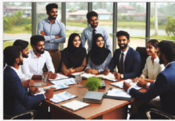
INVENTORY & MATERIAL MANAGEMENT