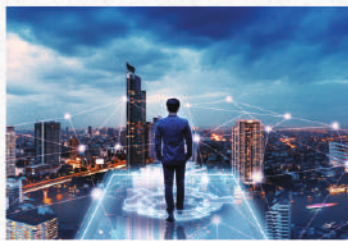
IMPORT & EXPORT GLOBAL BUSINESS MANAGEMENT