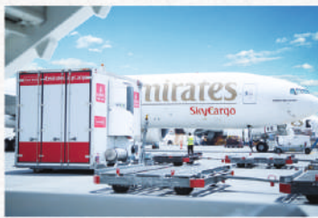
TRANSPORTATION & CARGO MANAGEMENT