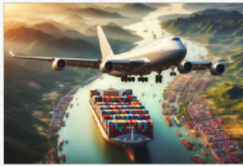
SUPPLY CHAIN & LOGISTICS MANAGEMENT