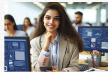
DOCUMENTATION & ENTERPRISE RESOURCE PLANNING